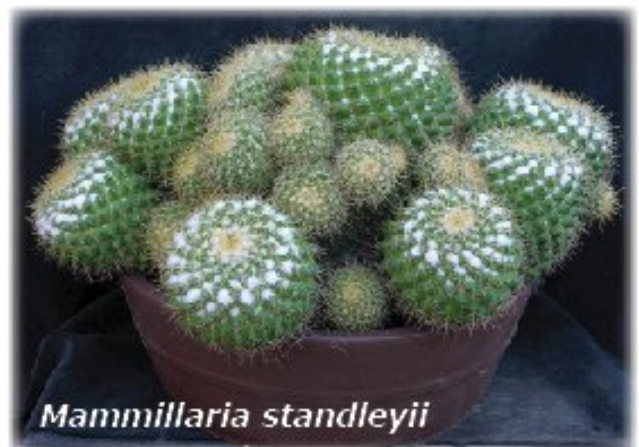
Mammillaria standleyii can be found as either a single or clumping species, normal in cultivation. It is a rapid grower.