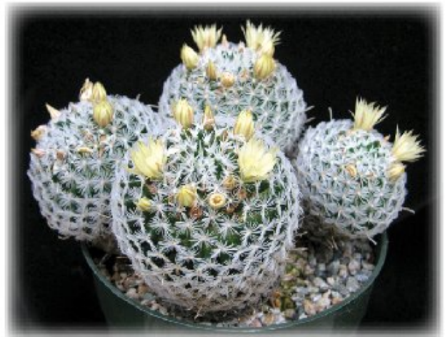
Mammillaria duwei , shown above, is from central Mexico.