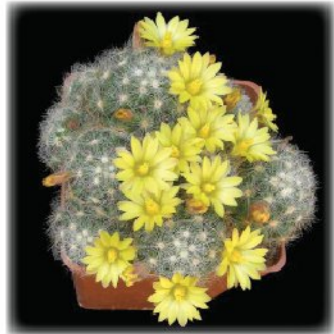
Mammillaria baumii is a densely spined species with wonderful large yellow flowers from Tamaulipas, Mexico

Propagation of Mammillaria clusters is easy. Cuttings can be taken at any time during the growing season (April to early November), left to dry for a few days and replanted in a clean potting mix (pure pumice is even better). Rooting is rapid, with short white roots generally appearing after a couple of weeks. Mammillaria are one of the easiest species to grow from seed. The seeds are simply placed on top of a damp potting mix, covered with a light coating of gravel, placed in a plastic bag in bright light, but out of direct sun and allowed to germinate. Germination usually occurs in a week or 10 days. The seedlings can stay in the plastic bag for several weeks until they get large enough to survive unprotected, and should then be removed to a still shaded, but brighter and drier environment. Best results are obtained when the seeds are started in late March to late May.